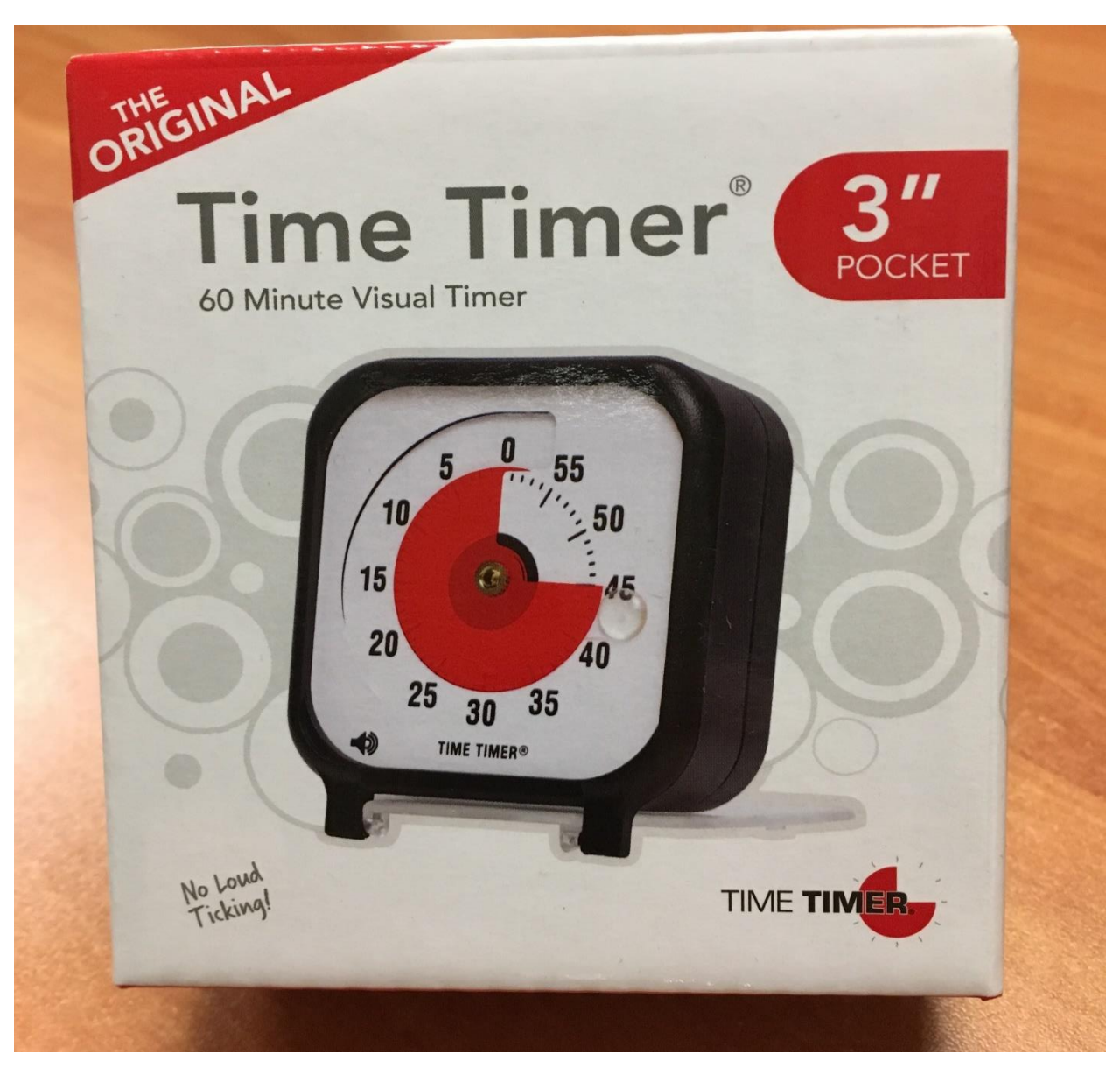
Includes: 1 Timer and 1 Instruction Sheet. Replacement cost: $44

Item # 39335050570550 Call Number: Time Timer